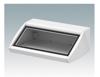
M5330106 UNIDESK M300 IP 54 Aluminium Traffic white RAL 9016 300x200x102mm IP 54