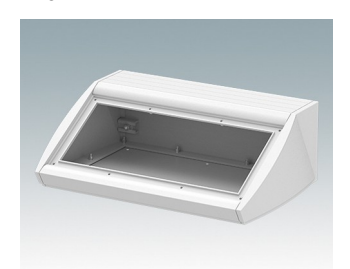
M5330116 UNIDESK M300 Aluminium Traffic white RAL 9016 300x200x102mm