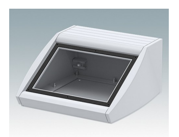
M5320105 UNIDESK M200 IP 54 Aluminium Light grey RAL 7035 200x200x102mm IP 54