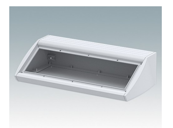
M5340115 UNIDESK M400 Aluminium Light grey RAL 7035 400x200x102mm