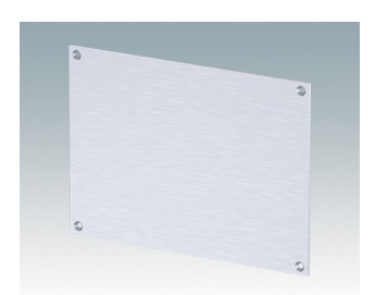
M5301502 Front panel M200 Aluminium Matt anodised 170x2x123mm