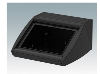
M5320119 UNIDESK M200 Aluminium Black RAL 9005 200x200x102mm