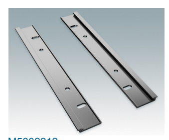
M5302212 Wall mount kit M200 Aluminium Matt anodised