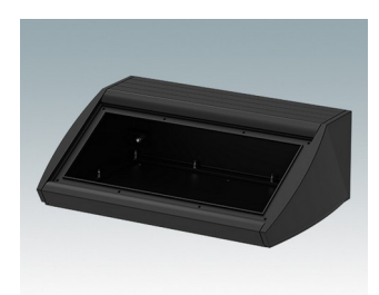
M5330119 UNIDESK M300 Aluminium Black RAL 9005 300x200x102mm