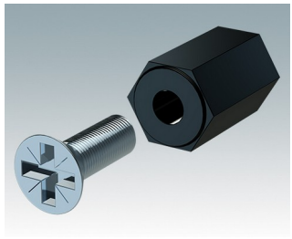
M5600001 PCB mounting kit PA 6 Black RAL 9005