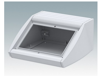
M5320115 UNIDESK M200 Aluminium Light grey RAL 7035 200x200x102mm