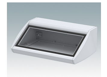
M5330105 UNIDESK M300 IP 54 Aluminium Light grey RAL 7035 300x200x102mm IP 54