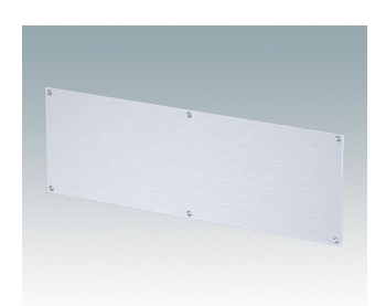
M5301504 Front panel M400 Aluminium Matt anodised 370x2x123mm