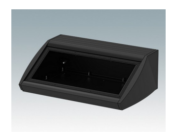
M5330109 UNIDESK M300 IP 54 Aluminium Black RAL 9005 300x200x102mm IP 54