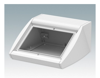
M5320116 UNIDESK M200 Aluminium Traffic white RAL 9016 200x200x102mm