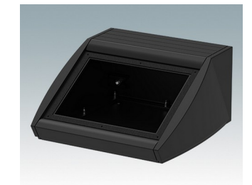
M5320109 UNIDESK M200 IP 54 Aluminium Black RAL 9005 200x200x102mm IP 54