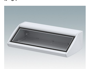
M5340105 UNIDESK M400 IP 54 Aluminium Light grey RAL 7035 400x200x102mm IP 54