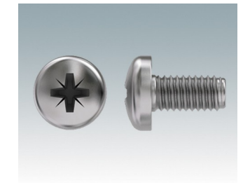
M5600010 PCB/Panel Fixing Screws, M3 Steel Zinc coated 6mm

Subject to technical modification without notice. © OKW Enclosures Ltd