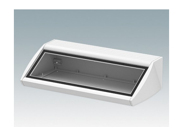
M5340106 UNIDESK M400 IP 54 Aluminium Traffic white RAL 9016 400x200x102mm IP 54