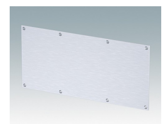
M5301503 Front panel M300 Aluminium Matt anodised 270x2x123mm