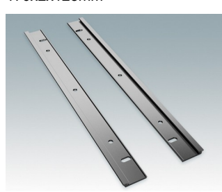
M5302213 Wall mount kit M300 Aluminium Matt anodised