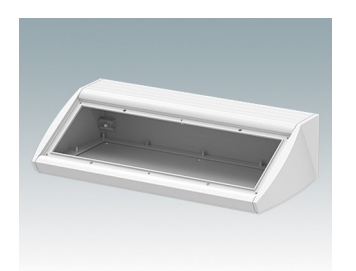
M5340116 UNIDESK M400 Aluminium Traffic white RAL 9016 400x200x102mm