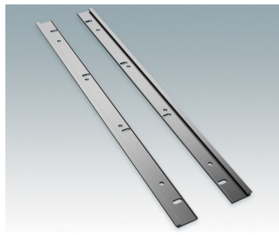
M5302214 Wall mount kit M400 Aluminium Matt anodised