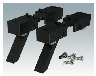
M5600049 Case Feet Kit 2 ABS (UL 94 HB) Black RAL 9005 34x17x16mm