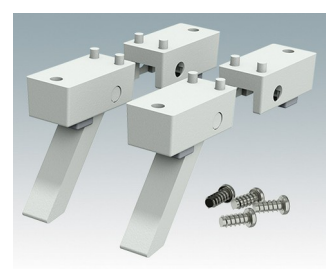
A9257207 Case Feet Kit 2 ABS (UL 94 HB) Off-white RAL 9002 34x17x16mm