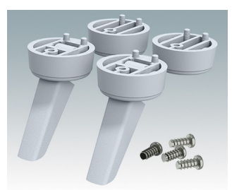
M6420205 Technofeet Kit 2 ABS (UL 94 HB) Light grey RAL 7035 30x30x12mm