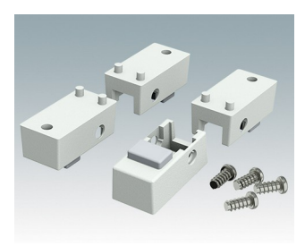
A9257107 Case Feet Kit 1 ABS (UL 94 HB) Off-white RAL 9002 34x17x16mm