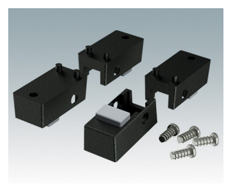
M5600019 Case Feet Kit 1 ABS (UL 94 HB) Black RAL 9005 34x17x16mm