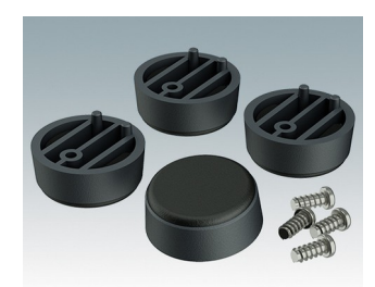
M6420104 Technofeet Kit 1 ABS (UL 94 HB) Anthracite RAL 7016 30x30x12mm