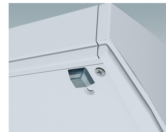
M5600100 Non-slip feet Rubber Transparent 12.6x12.6x5.7mm