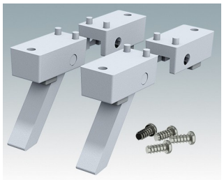
M5600045 Case Feet Kit 2 ABS (UL 94 HB) Light grey RAL 7035 34x17x16mm